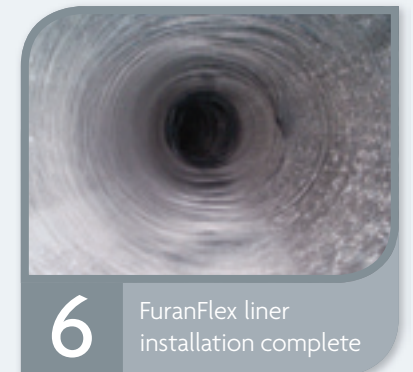
6 FuranFlex liner installation complete