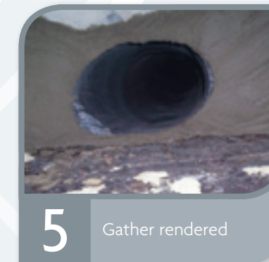
5 Gather rendered