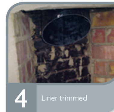
4 Liner trimmed