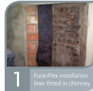
1 FuranFlex installation liner fitted in chimney