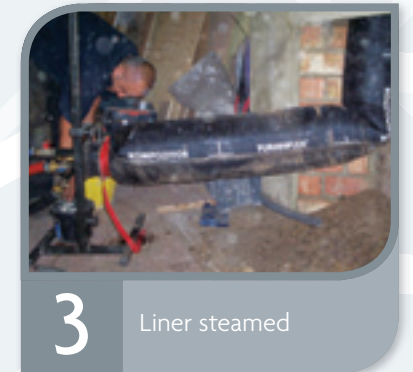
3 Liner steamed